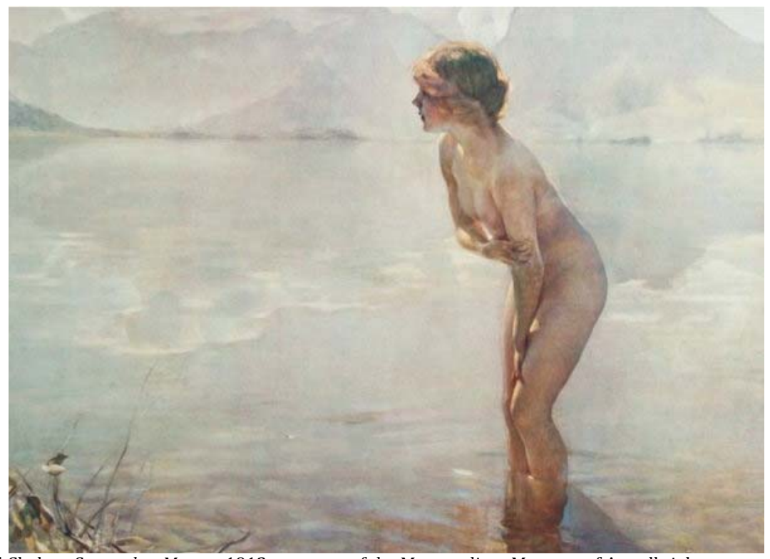
Paul Chabas, September Morn, c.1912

The subject of immorality was soon to literally go on trial in Chicago, and in such close timing to the Armory Show opening it couldn't be helped that it washed over charges of immorality cast upon the modernists. A reproduction of the painting by French artist Paul Chabas (1869-1937) entitled September Morn , winner of a gold medal at the Paris Salon, was shown that month at a local art store. Mayor Carter Harrison ordered his city art censor to march over to the Jackson and Semmelmeyer<sup>38</sup> art store and remove the offending work. The official municipal code stated: "No person shall exhibit...or sell...any lewd picture or other thing whatever of an immoral or scandalous nature." Famed Chicago sculptor and de facto senior member of the artist's community Lorado Taft (1860-1936) was quoted to say in disgust, "The person who can see indecency in 'September Morn' is to be pitied.<sup>39</sup>