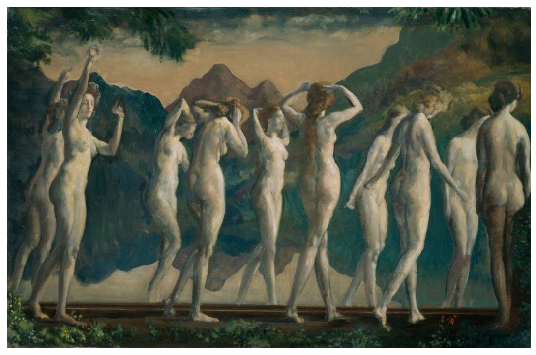
Arthur B. Davies, Maya, Mirror of Illusions, courtesy of the Art Institute of Chicago, all rights reserved.®

Their concept for the show was to progress from those whom they considered founders of modern art to those practicing the art in the contemporary scene. Monroe had called Davies "one of the most original and imaginative of American painters." Three years earlier the Art Institute had purchased Davies' Maya, Mirror of Illusions , a work that is a mystical representation of several female nude figures, but classically rendered; modern thinking, but certainly far from "bedlamic."